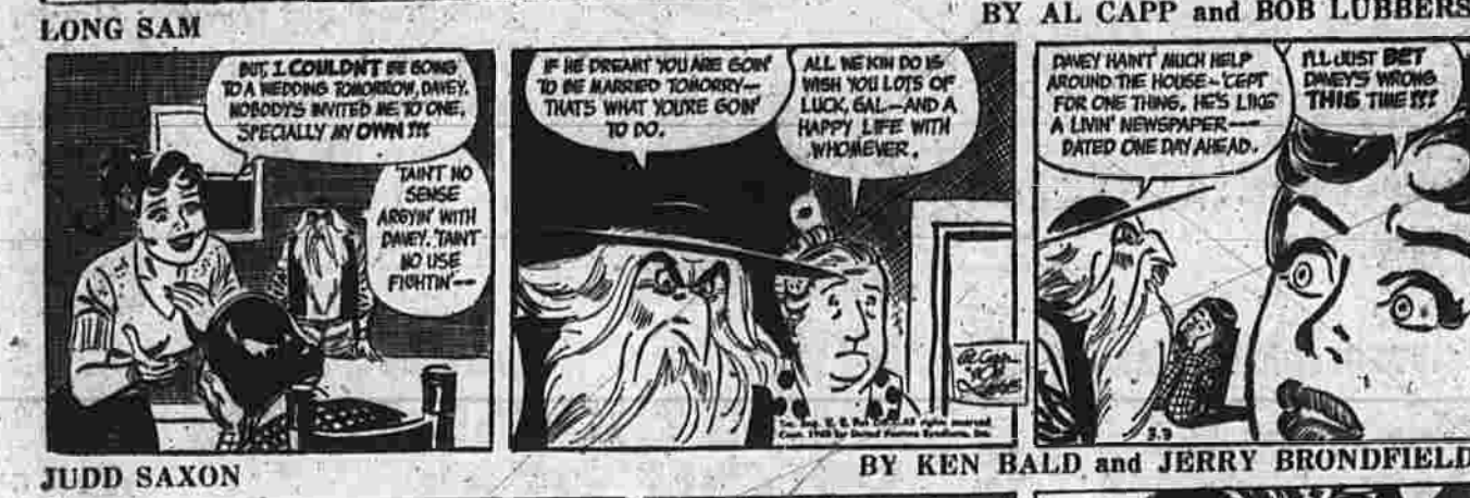
BY AL CAPP and BOB LUBBERS