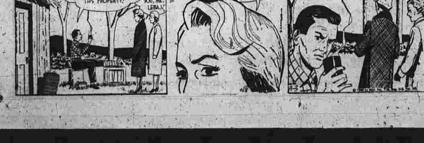
BY WILSON SCRIGGS